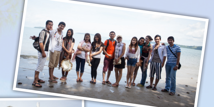
Finally, here we are at the beautiful landscape of Koh Kong beach