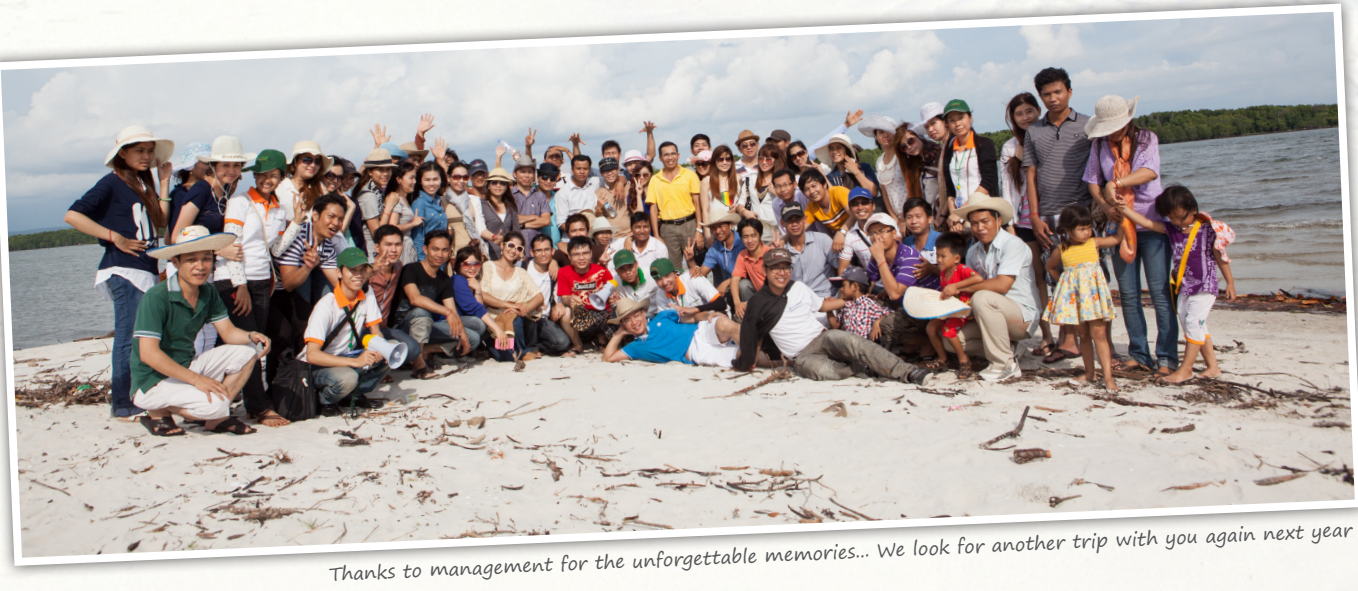
Everyone is witnessing the adventure in the beauty of the "Prey Korng Kang"

Can you count how many people in this Group Photo? We love the big smiles on thier faces